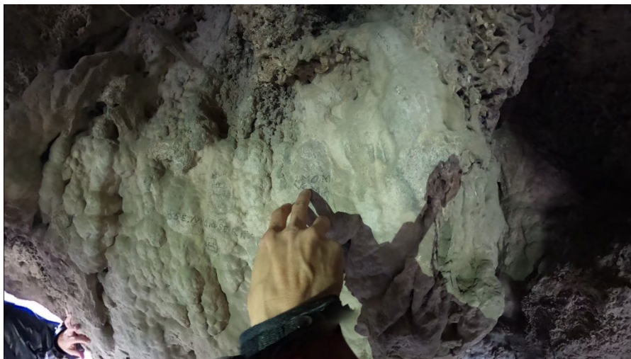
Banditry , by Claudia Pagès. Courtesy of the artist

Capellades, the artist's hometown, acquired significant prestige in the 18th century through the production of stamped paper, which was used mainly for judicial and administrative documents and as a tool for identification, legitimisation, colonisation, property and control. The video that flanks the wall was filmed in two locations in Capellades: the Museu Molí Paperer—which houses an important historical collection of stamped paper—and the Abric Romaní del Capelló—a Neanderthal archaeological site that preserves marks from different periods engraved on its stone walls. In the curators' words: "Both the museum and the Palaeolithic cliff have accumulated signs that transit an ambiguous space between words and images."