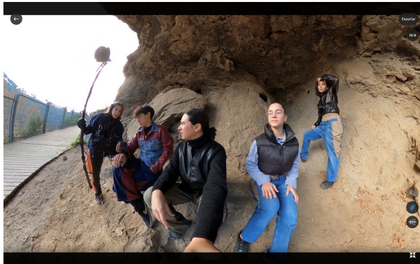
Banditry , by Claudia Pagès.

For the exhibition that opens the new series at Espai 13, the artist explores the history and political consequences of marks such as watermarks and those featured on stamped paper. Pagès has divided the room in two by means of a wall of paper featuring watermarks created by her. Two projection screens facing each other on either side of the dividing wall alternately reproduce parts of the same audio-visual piece.