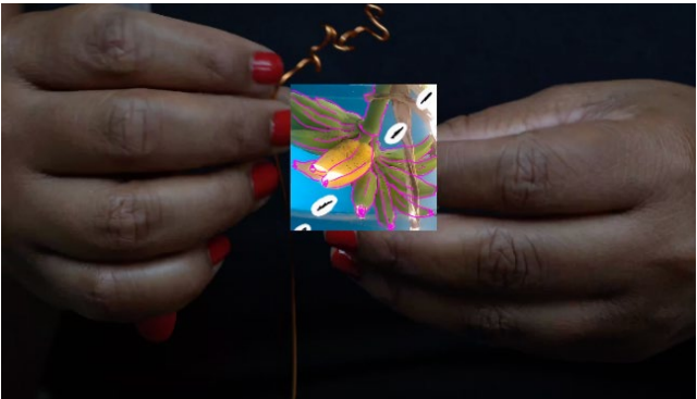
The Earthquake is Intact by Jota Mombaça and Iki Yos Piña Narváez Funes, 2023. Project images. Left Image by Fátima Guariota. Right image courtesy of the artists.