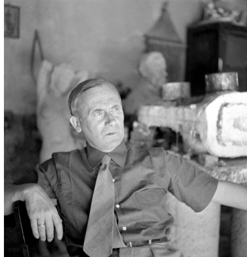
Joaquim Gomis. Portrait of Joan Miró, 1944.

Images available at http://bit.ly/UniversMiró