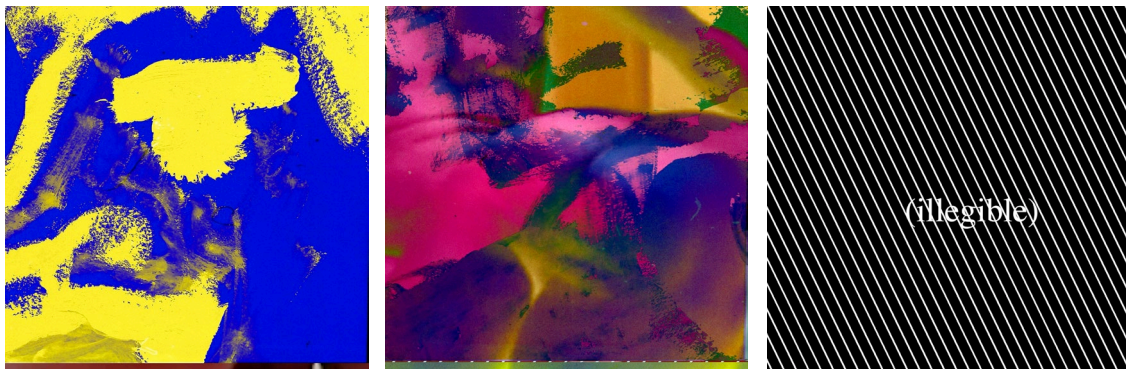
P. Staff. Impact Play , 2023. Stills.

In Impact Play , P. Staff establishes a parallel between some of the visual resources of these films and clinical techniques for visualising the body – magnetic resonance imaging, ultrasound, X-rays. According to the curatorial team: 'These are optically enhanced images that further medicalise the body while at the same time revealing contrasts in human texture, density and temperature that reveal the somatic as a site of integral variation.' Burns and stains of colour associated with film as a physical medium therefore appear overlaid on human skin to underscore the permeability of bodies. These visual effects are interrupted by representations of strange physiognomies that spectators can only guess at. Completing all of this is a broken poem naming various parts of the body and forms of bodily contact that speeds up until becoming impossible to read.